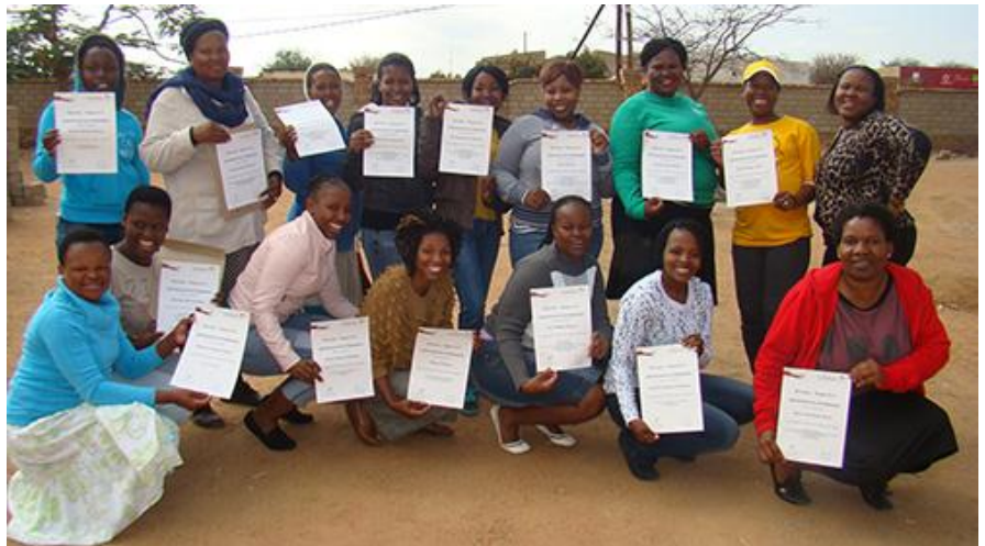
Some of the participants in Dennilton excited about their certificates.

Community members who participated in the Dennilton programme expressed their views on the programme. See their comments below: